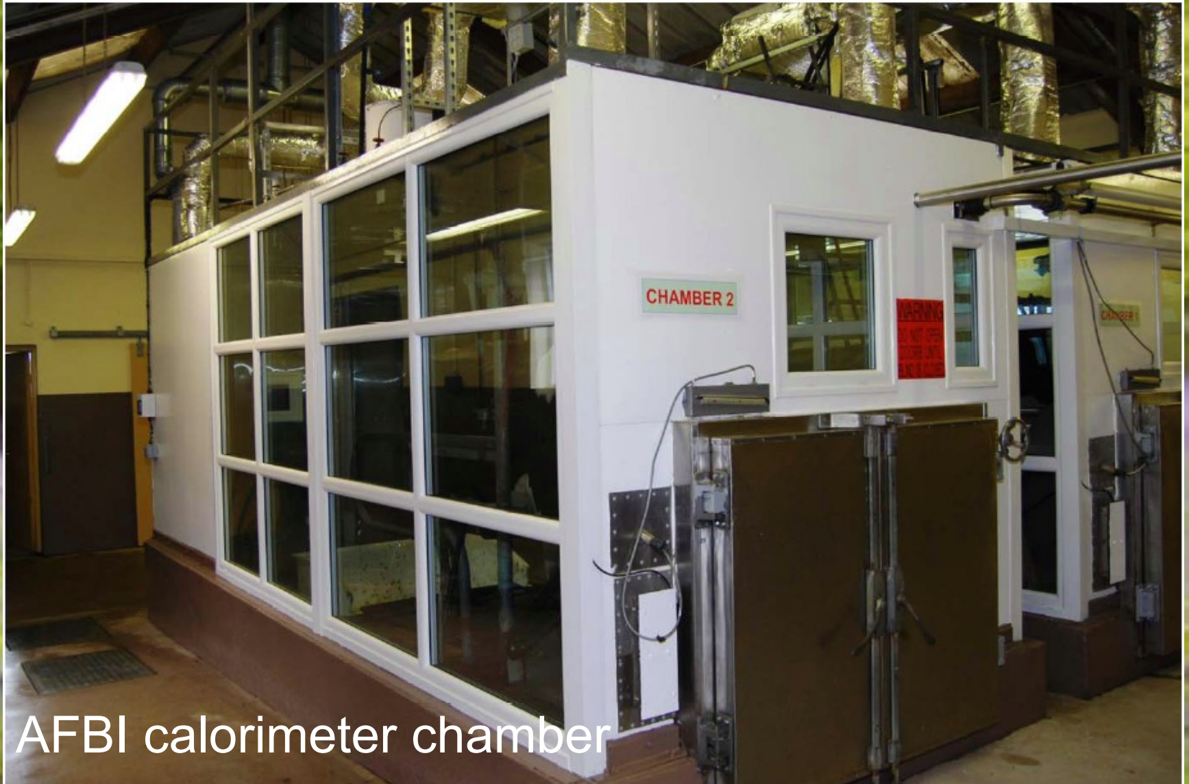
AFBI calorimeter chamber

defra Department for Environment Food and Rural Affairs